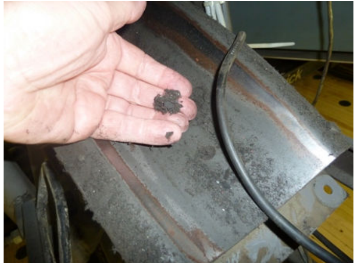
Lots of cleaning being done on all parts.