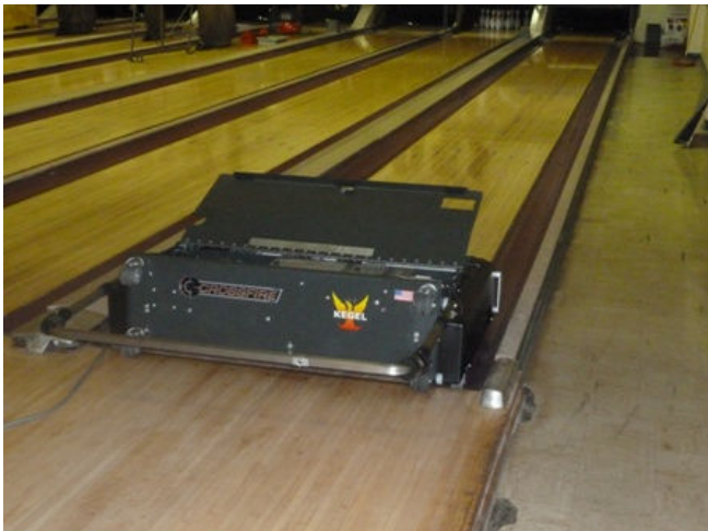
Lane oiling machine being completely overhauled