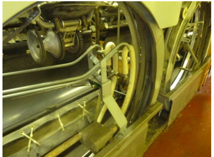
Ball returns being fixed and cleaned